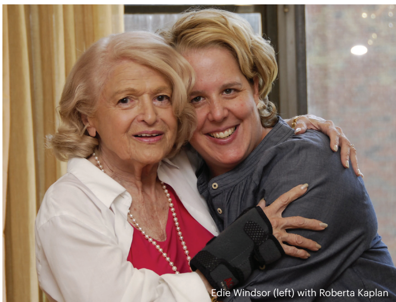
Edie Windsor (left) with Roberta Kaplan